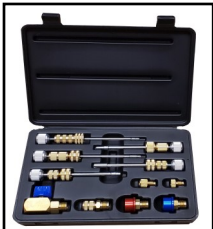
Valve Core Kit

Replace Valve Core Without Losing System Charge! Works With R12 & R134a Systems.