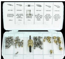
Valve Core Kit