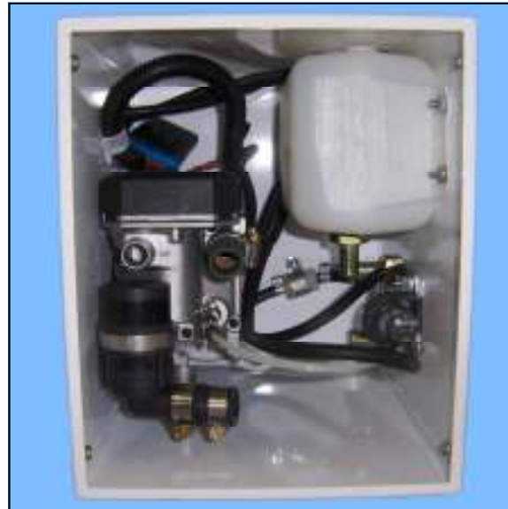
Easily Remove Cover To Service