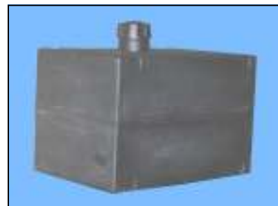
Optional 6 Gallon Fuel Tank* (Dims: 15" L x 10" W x 10" H)